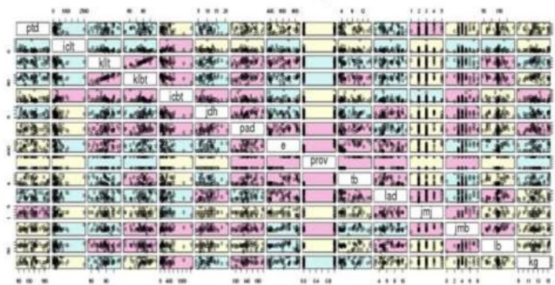
Figure 2. The correlation of each morphological character variable and environmental factor character of brix content of palm sugar aren ( Arenga pinnata, Merr. ) provenans Maros dan Sinjai

Based on the correlation direction between each morphological character variable and environmental factors on Brix content, the right direction in correlation displayed positive correlation, while the left direction was negative correlation. However, the unclear direction does not configure any correlation.